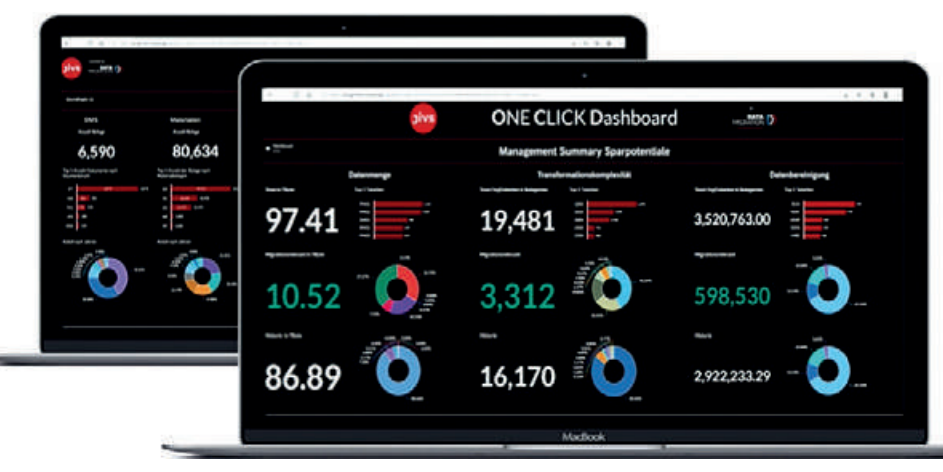
Data Reduction Potential Analysis: Auf Knopfdruck sehen SAP-Bestandskunden, wie viele Daten sie beim S/4-Umstieg NICHT transformieren und migrieren müssen.